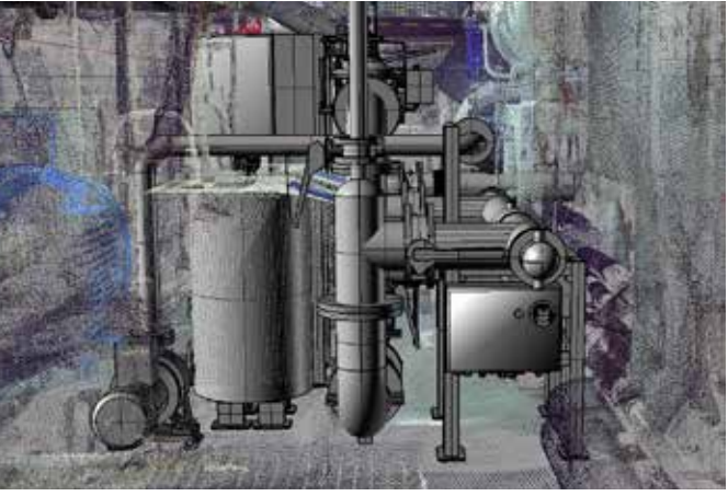
Ballast water treatment system modeled on 3D scan results.