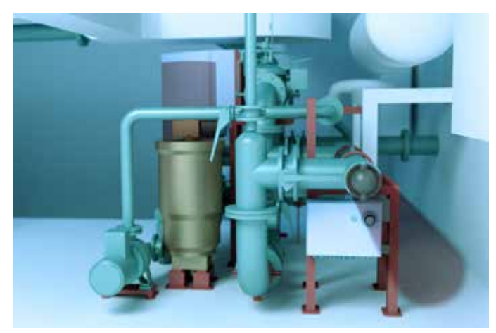
3D rendering of modeled system