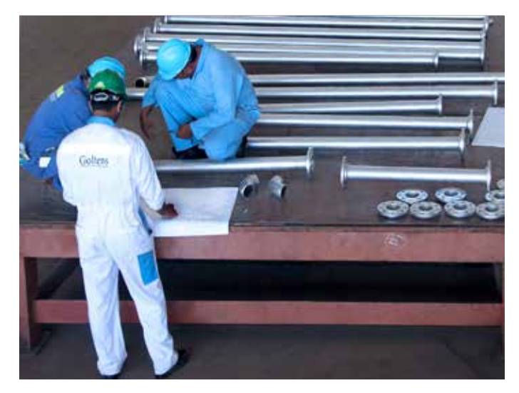
Goltens technicians performing quality checks on pre-fabricated piping prior to installation.

Goltens utilizes scanning and modeling to determine the optimal routes for machinery movement and removal with the minimum possible disruption and hull cutting.