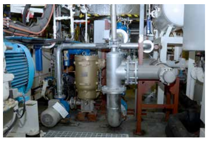
Installed system per detailed design.