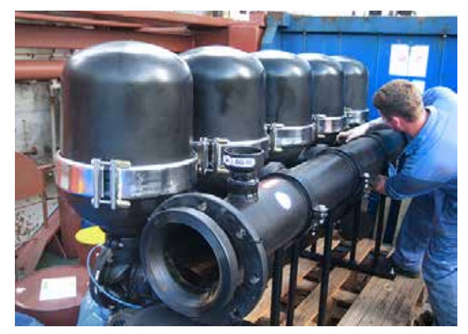
Goltens technician preparing a ballast water treatment system for installation.

Whatever approach is chosen, Goltens Green Technologies can support any and all phases of the project and lead to the most efficient installation possible.