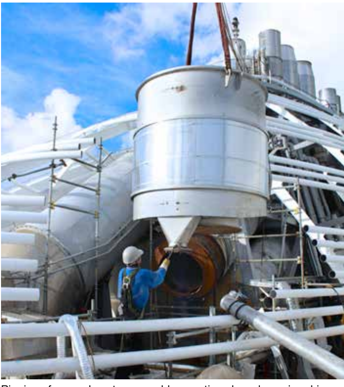
Rigging of new exhaust gas scrubber section aboard a cruise ship.

Data generated by a 3D laser scan is used to model the chosen or shortlisted systems into the existing space. At this point, both the shipowner and chief engineer will be able to clearly see that the final system location will not obstruct normal ship functions, and verify available space for maintenance. Several systems can be modeled to show which would be the optimal solution in terms of fit.