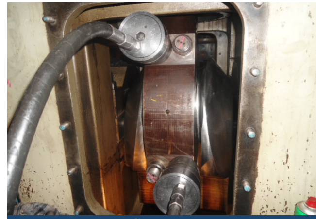
Connecting rod bolt/nut tightening