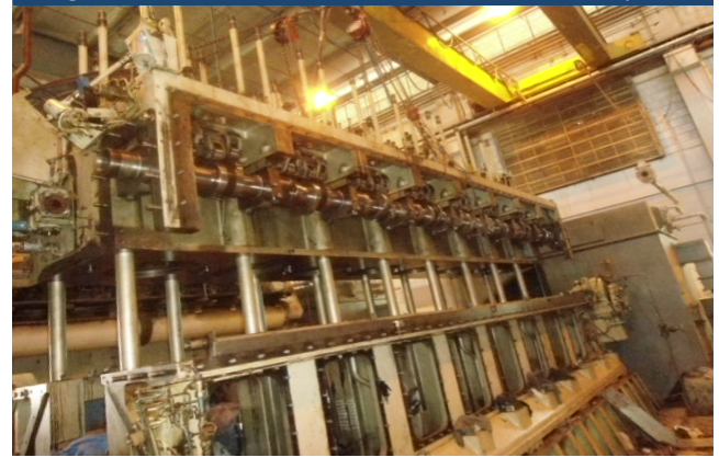
Replacement crankshaft pre-flange reaming

Engine disassembled with block lifted off bedplate