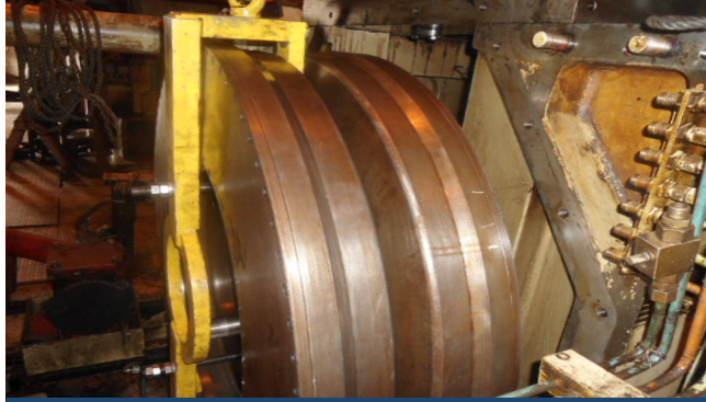
Reconditioned vibration dampers being fitted