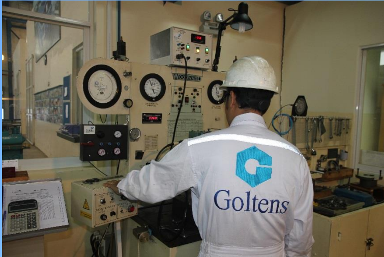
Woodward Test Bench