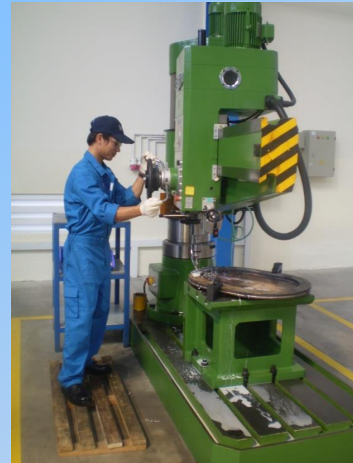
Big radial drilling machine Z30 50 x 12