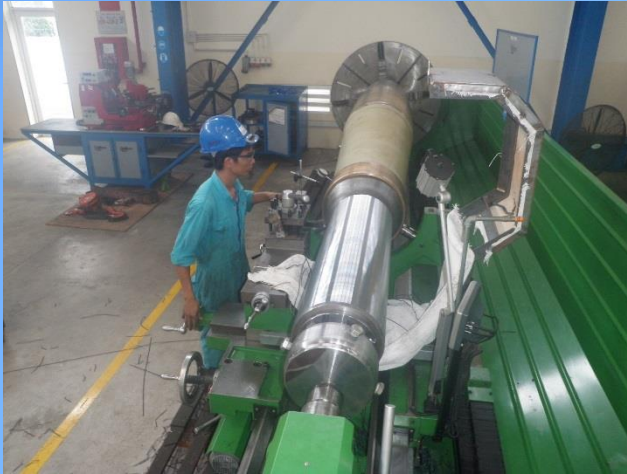
Lathe Machine ML 1120 x 6000 L