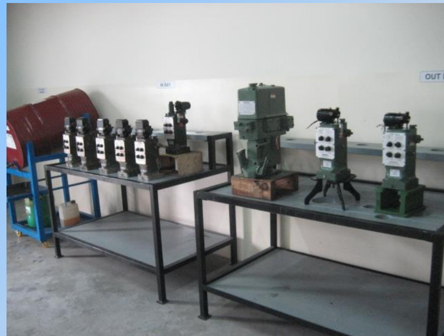
In Bay and Out Bay Governor