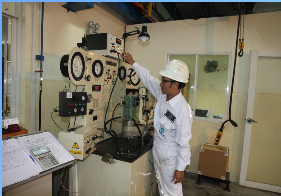
Woodward Test Bench