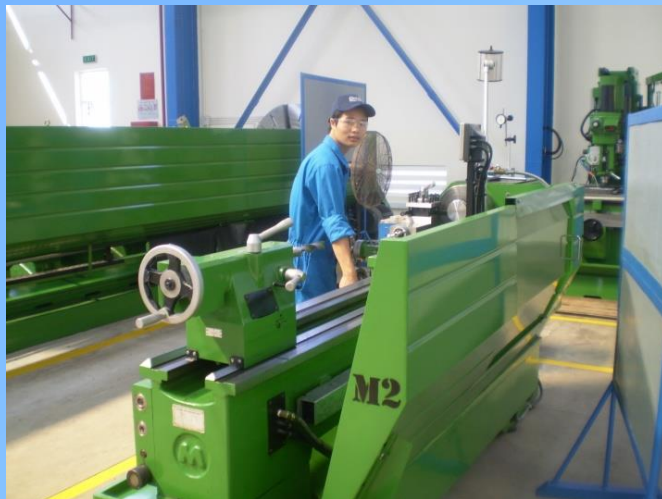
High speed lathe machine- ML 460 x 1600L