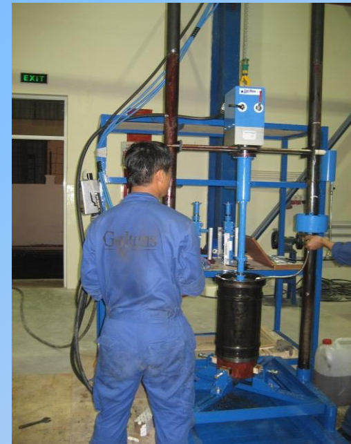
Honing machine:ID 190 - id 500