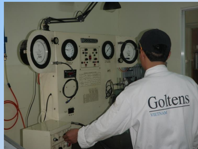
Governor Test Bench Table