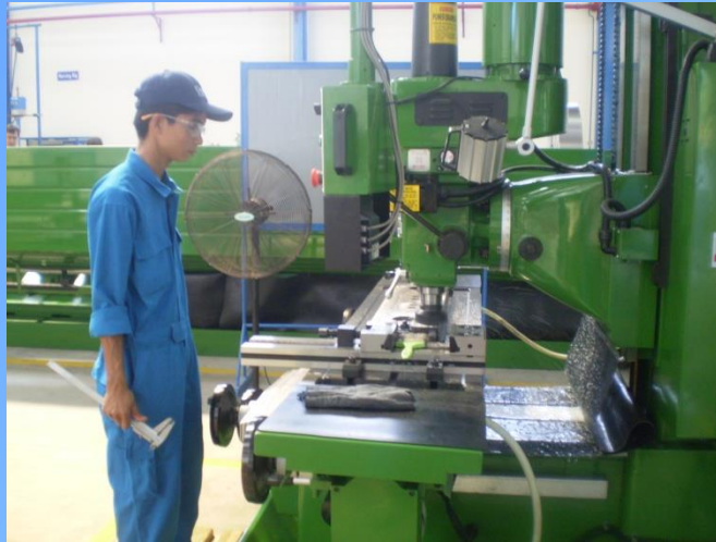
Vertical milling machine - MCM -1000/5