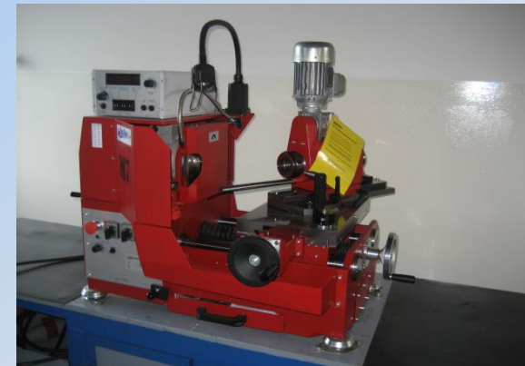
The Spindle grinding machine