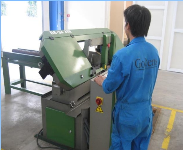
Band saw machine - BS-SA 350