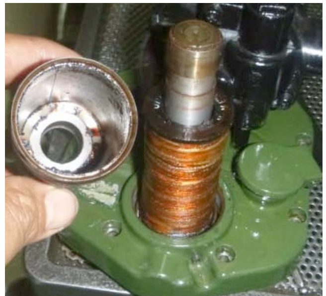
Figure 2: Neglected, un-serviced stop solenoid