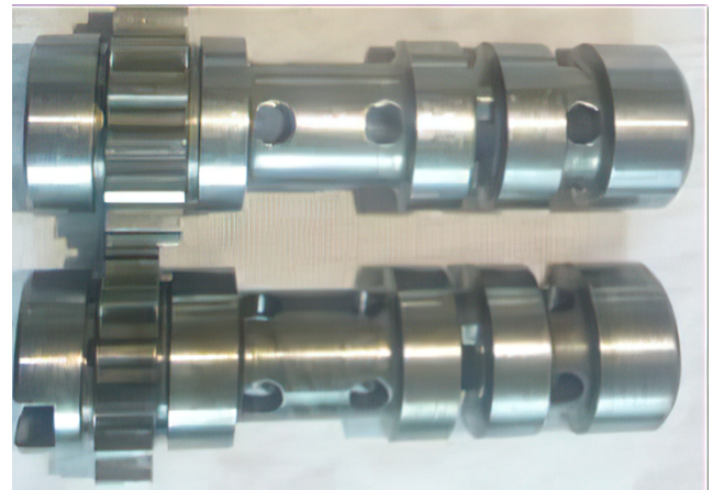
Figure 1: Pilot Valve bushings indicating the pump difference