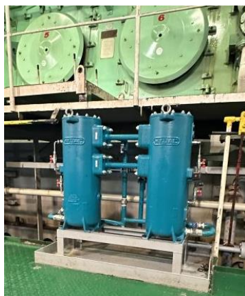
SEA-MATE Duplex Filter Solution

Compatibility: The filter seamlessly integrates with the SEA-Mate® Blending-on-Board system, offering proven benefits such recycling controlled replacement oil and contributing to lower the oil consumption.