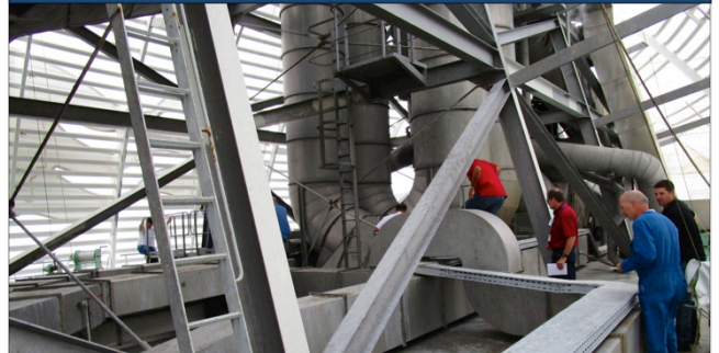
Goltens specialist conducting 3D laser scanning