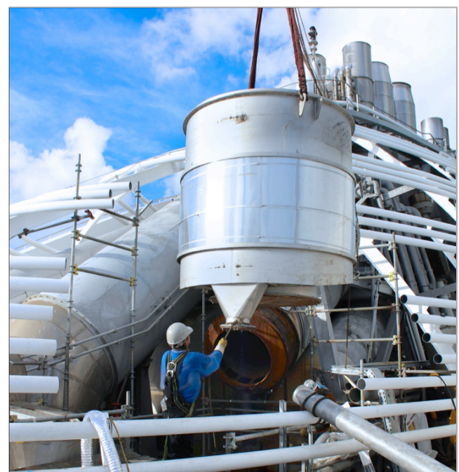
Rigging of exhaust scrubber sections aboard