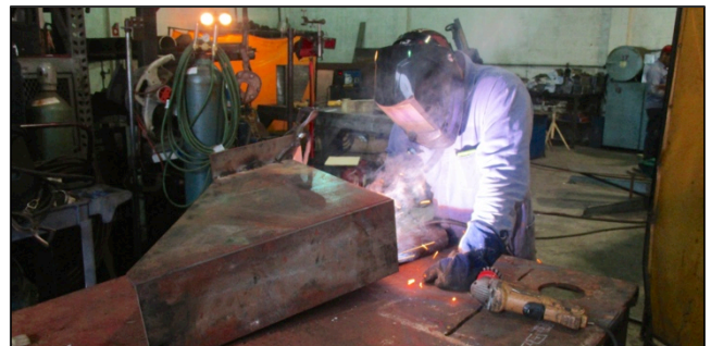
Foundation structure prefabrication in workshop

As a result of the successful completion of the job, Goltens was awarded and completed a similar job for a sister vessel a few months later.