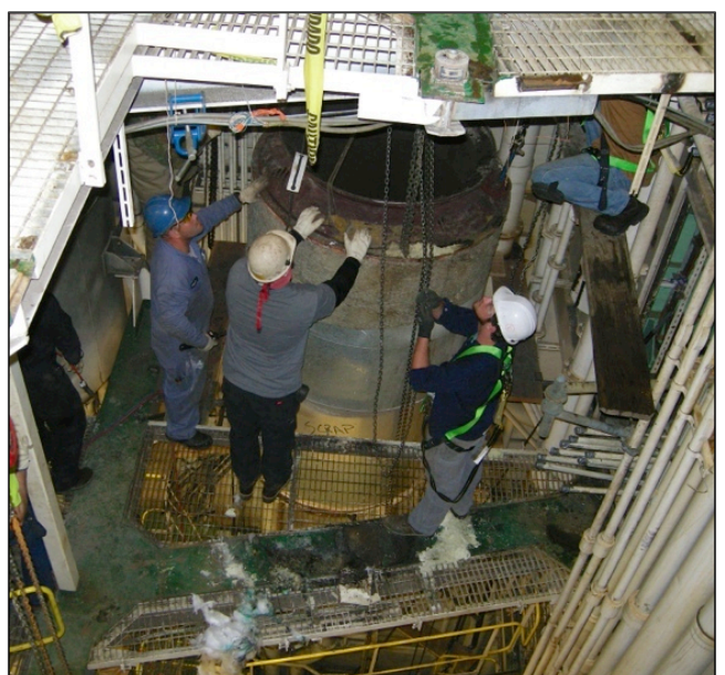
Removal/Rigging of exhaust silencer sections